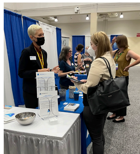
ArchivesSpace exhibiting at the Society of American Archivists annual meeting, August 2022