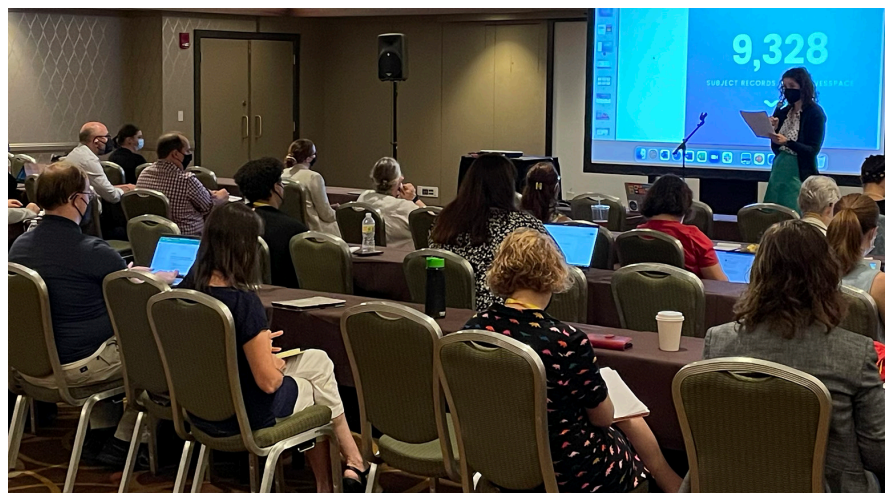
Annual Member Forum, August 2022 – our first in person since 2019

represented in events throughout the year